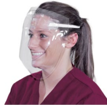
Curved 3D Face Shield $47.00

https://facilisafety.com/products/disposable-3-ply-face-masks