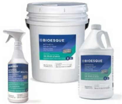
Bioesque Botanical Disinfectant