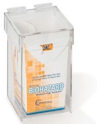
Small Countertop Waste Can

https://facilisafety.com/collections/workplace-surface-disinfection/products/bioesque-botanical-disinfectant