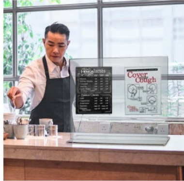
Partition with Sign Holder $125.00