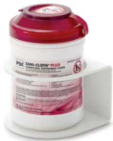
Wall Mount Holders $29.00

https://facilisafety.com/collections/ppe-dispensers/products/wall-mount-holders