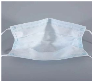
Disposable, 3-Ply Face Masks $22.95

https://facilisafety.com/collections/personal-protection/products/employee-care-kits