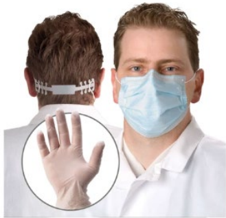
Employee Care Kits $56.00