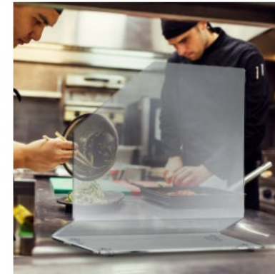
Partition with Suction Cup Base and Cutaway Corner $129.00

https://facilisafety.com/collections/guards-and-shields/products/pop-up-transparent-partition