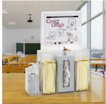
Locking Personal Protection Organizer with Sign Holder from $179.00

https://facilisafety.com/collections/ppe-dispensers/products/locking-personal-protection-organizer-with-sign-holder