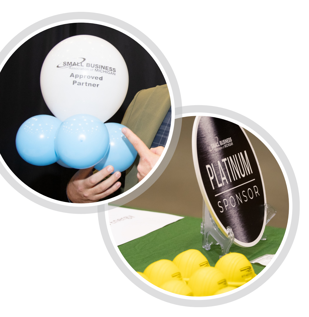
EXHIBIT COST $599

Booths are assigned on a first-paid, first-served basis. Every effort will be made to avoid assigning competing companies in nearby booths.